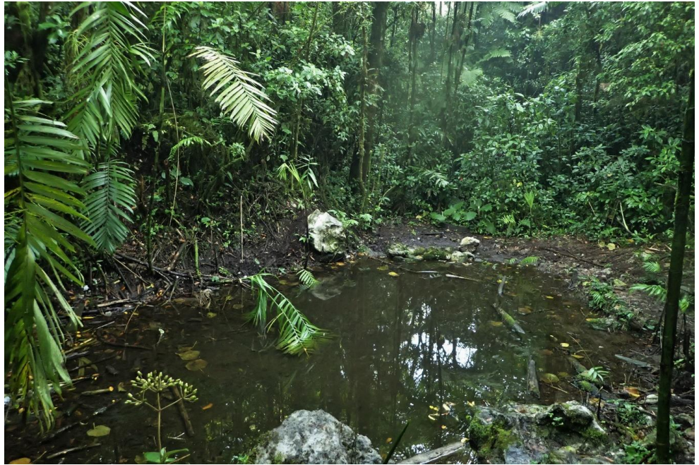
Figure 2. Study site at a seasonal pond in the lower montane forest at Reserva Natural Privada Sac Wach Já, Alta Verapaz, Guatemala.