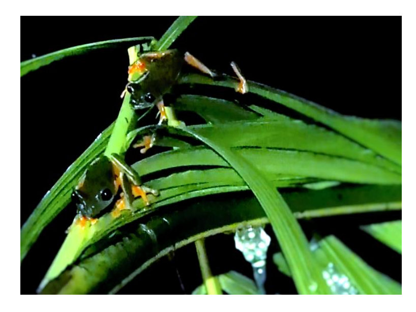
Figure 4. A male black-eyed leaf frog ( Agalychnis moreletii ) performing a tremulation display to another male. In the background, two egg clutches can be observed on top of the palm leaves.

Each act consisted of the male extending both hind limbs, uplifting his hind end followed by elevating and lowering his hind end repeatedly (Figure 4). Some encounters were followed by aggressive interactions of one male grappling another (links to example videos appear <u>here</u> and <u>here</u>). We also observed males kicking other males, some of which ended up falling off the leaves. Several tremulation displays were observed accompanied by kicks, pushes and low "chuckle" calls between males. One amplectant male was observed doing a tremulation display while being on top of a female. The displays were performed regardless of the light condition, under white light or infrared capable cameras.