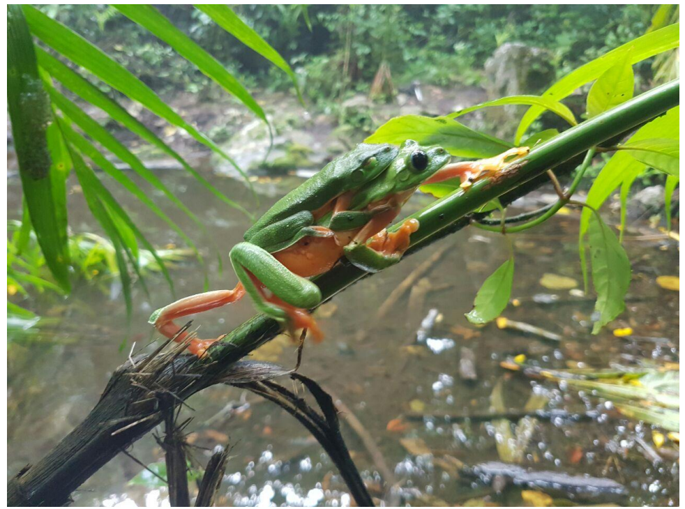
Figure 1 . An amplectant pair of Black-eyed Leaf Frogs ( Agalychnis moreletii : Hylidae) found in the morning during the breeding season at Reserva Natural Privada Sac Wach Já, Alta Verapaz, Guatemala. The male appears on top of the female and a clutch of eggs is visible at the upper left corner.